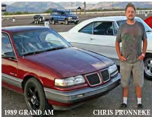
1989 GRAND AM