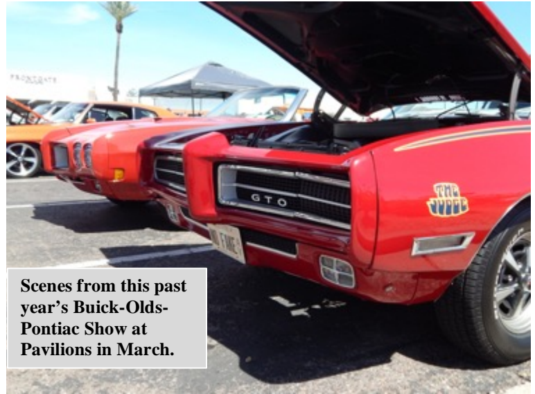
Scenes from this past year's Buick-Olds-Pontiac Show at Pavilions in March.

But it's time to crank over those V8s and bring your favorite Pontiac (the one with air conditioning) to our first club meeting of the season THIS SATURDAY, at Pavilions! Park your car along our Pontiac Row (west side of McDonald's parking lot) and come into Denny's for our 3:30 pm meeting. The drinks are on us!