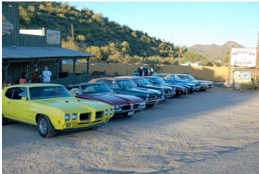
The Goats grazing' at the Buffalo Chip Saloon.